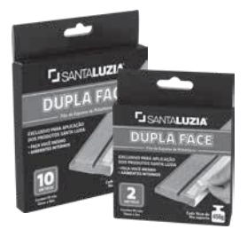
Double Sided Tape