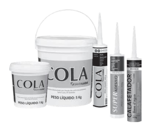
Heavy Duty Adhesive and Sealant